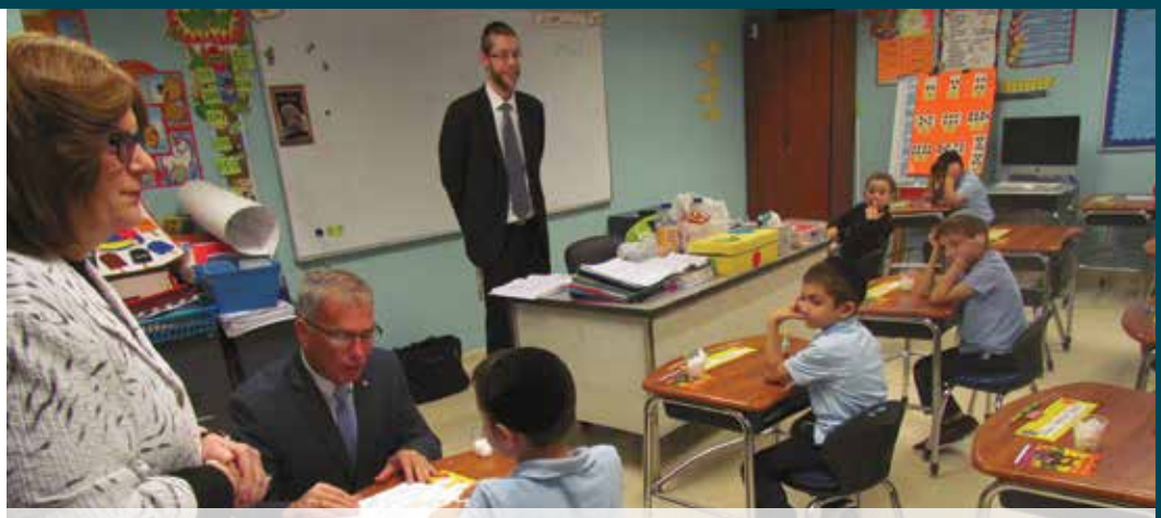
In November, I toured Politz Hebrew Academy and learned about its school community, which provides quality education to students from our district and beyond. This unique institution is committed to helping their students achieve academic standards to the best of their abilities while preparing them for life as productive and ethical members of society.