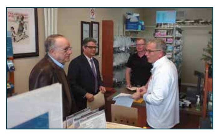
I joined Philadelphia Councilman Bobby Henon for a pharmacy tour to raise awareness about Narcan, a crucial tool in the fight against the opioid epidemic.

The deadline to apply for a rebate on property taxes or rent paid in 2017 is June 30, 2018.